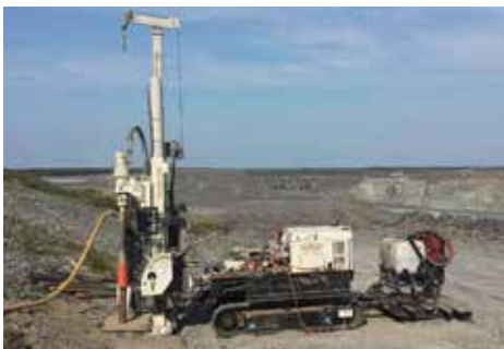
7822DT gathers geotechnical information for a new mining site.