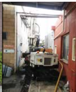
Squeezing between buildings.