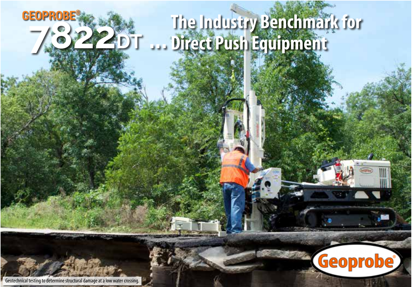
Geotechnical testing to determine structural damage at a low water crossing.