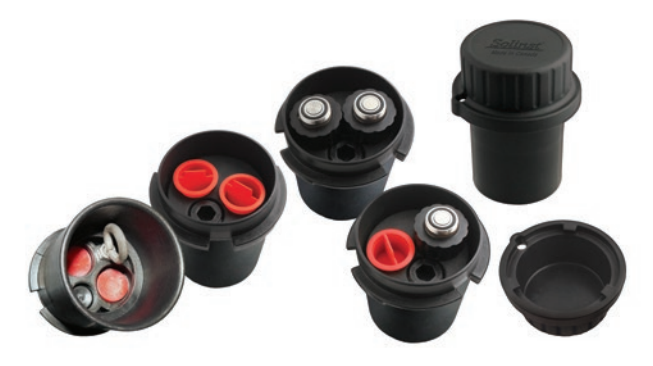
Levelogger 2" Locking Well Cap Installations (see Well Caps data sheet for more details)

The cap is vented to equalize atmospheric pressure in the well. It slips over the casing, and the cap can be secured using a lock with a 3/8" (9.5 mm) shackle diameter.