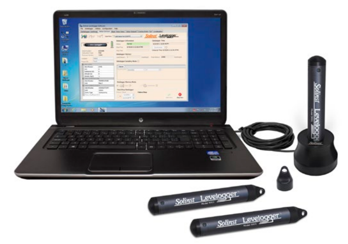
Fast communication and downloading speeds with a high speed Optical Reader