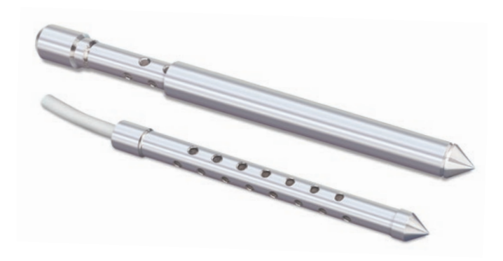
Model 615 Drive-Point and Shielded Drive-Point Piezometer

Solinst Drive-Point Piezometers can be driven into the ground with any direct push or drilling technology, including the Manual Slide Hammer shown at right. To avoid clogging or smearing of the screen during installation, a shielded version is also available.