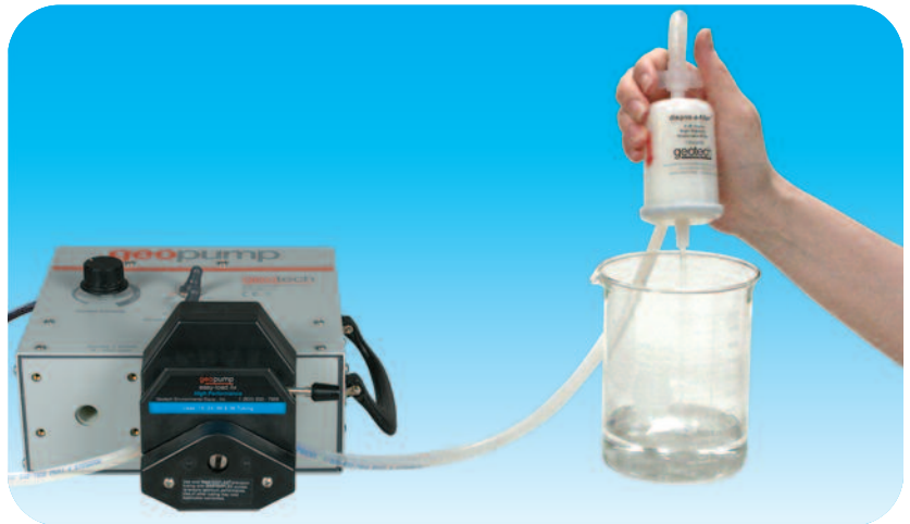
Sample collection with the Geopump™ Peristaltic Pump Series II with optional easy-load II® pump head (dispos-a-filter™ capsule sold separately)