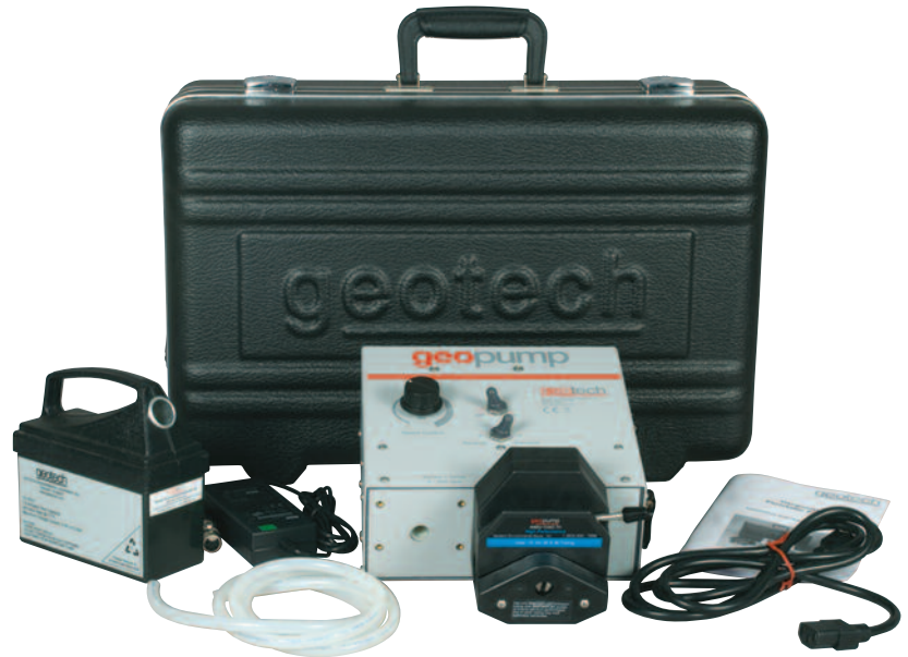
Geopump™ Peristaltic Pump Series II Kit with optional easy-load II® pump head, modular battery, 5 ft. (1.5 m) tubing, carrying case and power cord